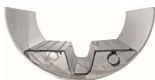
Therm-Liner Form A