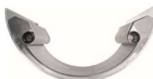
Therm-Liner Form B